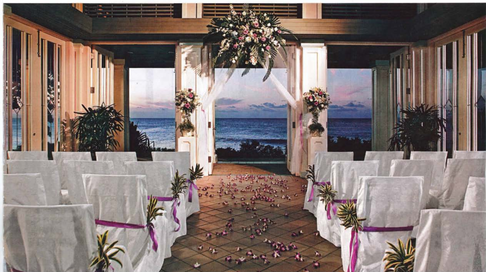
Above: Couples love the views from the glass-walled chapel at Turtle Bay Resort. Opposite: Kona Village Resort offers 82 acres of photo ops.